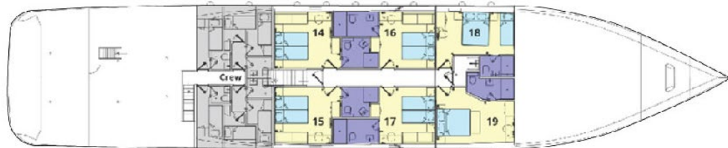
Lower deck II